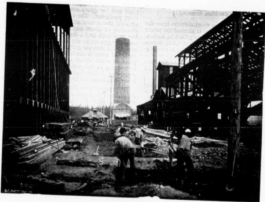
The Building of the Big Stack at Crofton.