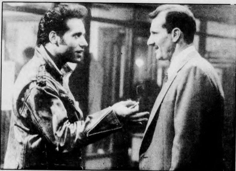
You have to go beyond Andrew Dice Clay's (above, left) reputation to judge Ford Fairlane . Only then can you see how bad a film it really is.