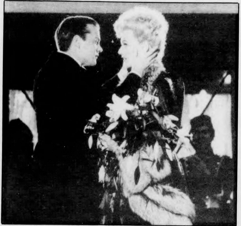
Kiefer Sutherland and Emily Lloyd play a couple of cute, psychotic kids in Chicago Joe and the Showgirl .

Chicago Joe and the Showgirl is based on the "cleft-chin mur-