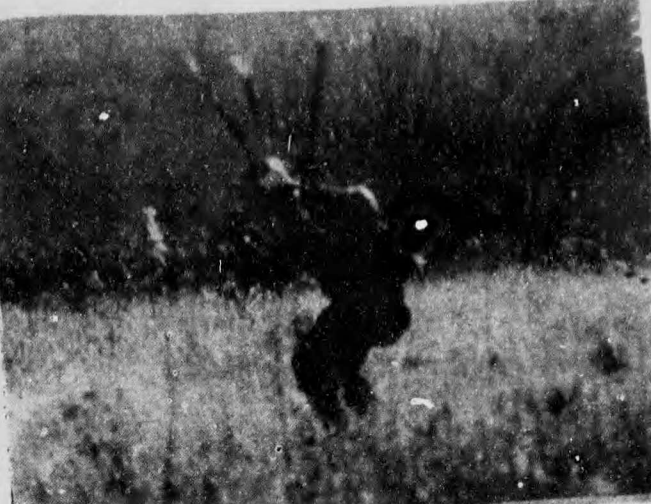
A sequence of events leading to a successful landing by one of UNB's parachute club members. This year the club has a record