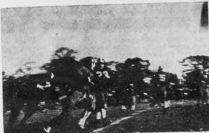
Charge To One-Sided Victory