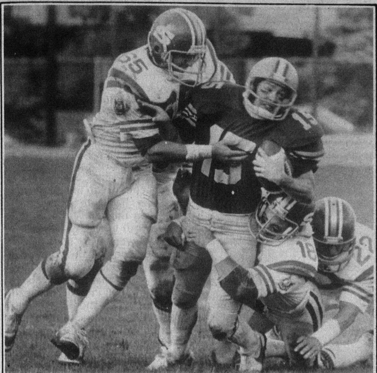
The Bears Football team goes to the coast this weekend to take on the UBC Thunderbirds.