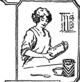
Close top, shake for a moment