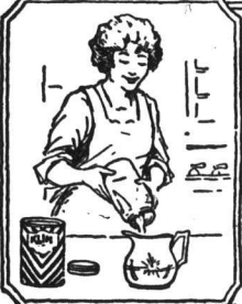
Pour Liquid Klim into a pitcher