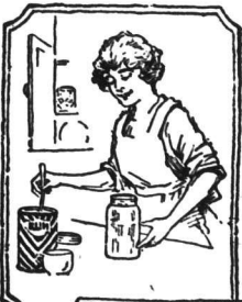
Place Klim on top of water in a fruit jar

B.C. Distributors: Kirkland & Rose, 132 Water St., Vancouver, B.C.