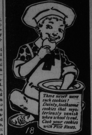
Made by The Woods Milling Company, Limited, Canada.