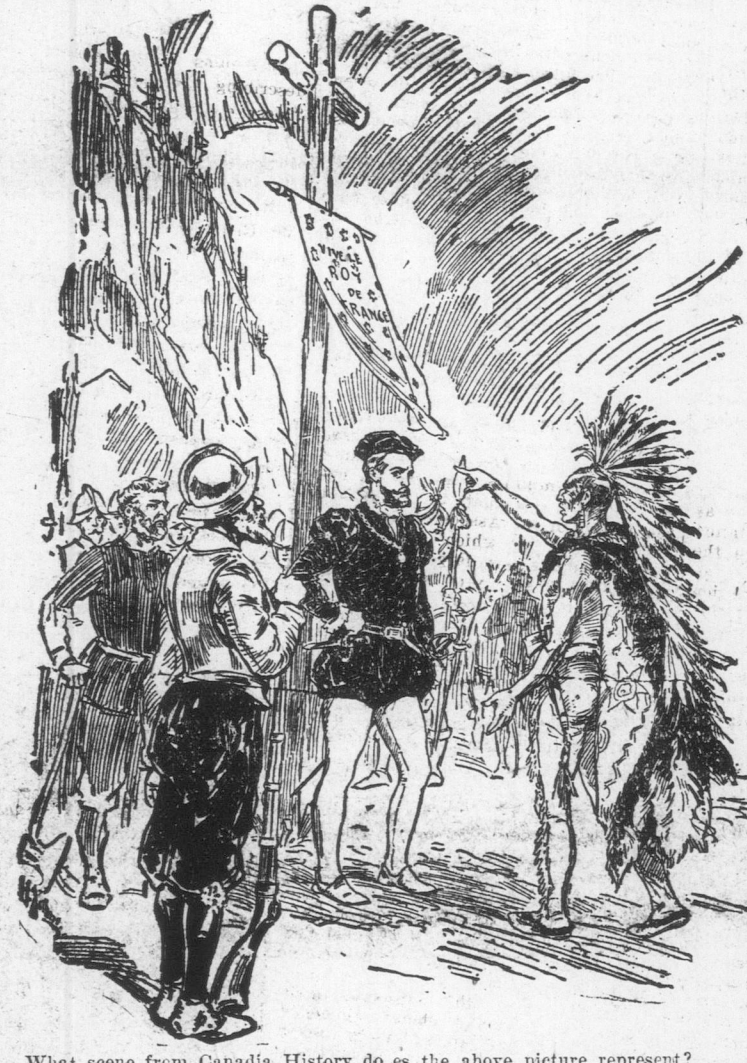
What scene from Canadia History do es the above picture represent?

who fronts him, at the head of a dusky band, his bear-skin cape flung back from his shoulder, and his crest feathers tossing in the wind, as, with passionate