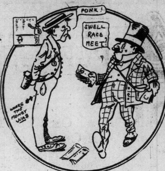
After the Get-Away Day.