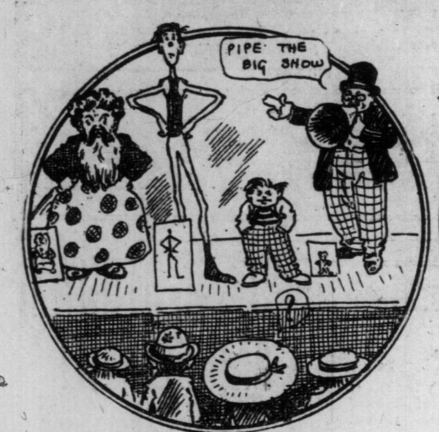
Fun Restarts at Island and Beach.