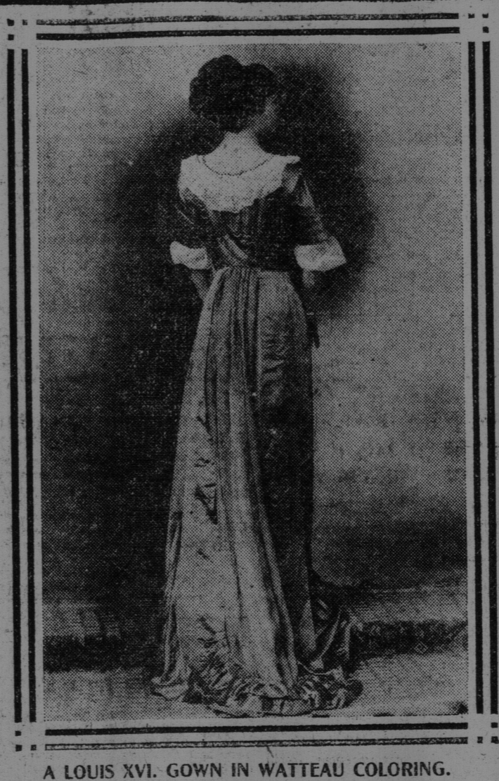
A LOUIS XVI. GOWN IN WATTEAU COLORING. Tinted gray combined with pink—the exclusive color scheme of many of the dainty Watteau paintings—has been used for this charming theatre and restaurant frock. The gray chiffon skirt has a deep gray satin hem—a modish and most practical feature of this winter's evening costumes. The bodice matches the satin hem and opens in front over a vest of pink satin, the same tint being used beneath the gray chiffon skirt. Delicate white lace forms the tucker above the bodice and the little sleeves which open from under the satin ones. At the back is a Watteau plait of chiffon and satin, which ends in a moderate train.