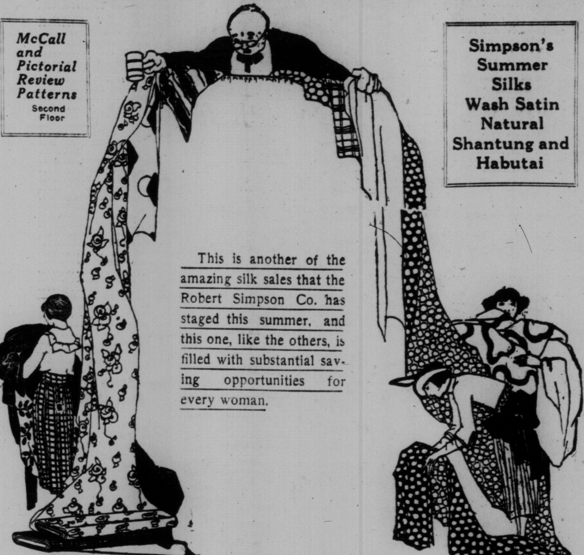
McCall and Pictorial Review Patterns Second Floor

Simpson's Summer Silks Wash Satin Natural Shantung and Habutai