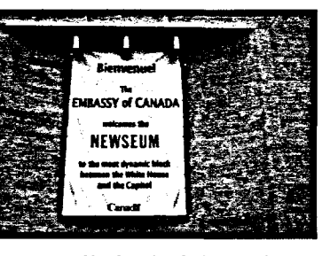
The Canadian Embassy welcomed the new museum with a sign.

Meet Our Neighbours: A new museum next door to our embassy in Washington, D.C., explores five centuries of news history—and puts Canada in the spotlight. By Eric Portelance