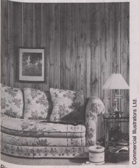
<sup>Pi</sup>ne embossed panelwood from Seaboard <sup>Lum</sup>ber will enhance a room.

• Seaboard Lumber Sales Company Limited • lumber, plywood, shakes and shingles.