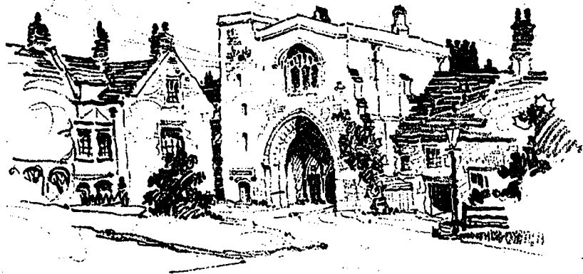
Old Gate. Durham Cathedral, Eng. C.D. Oct. 25/13

UPPER SKETCH: ELVET BRIDGE, DURHAM ENGLAND.