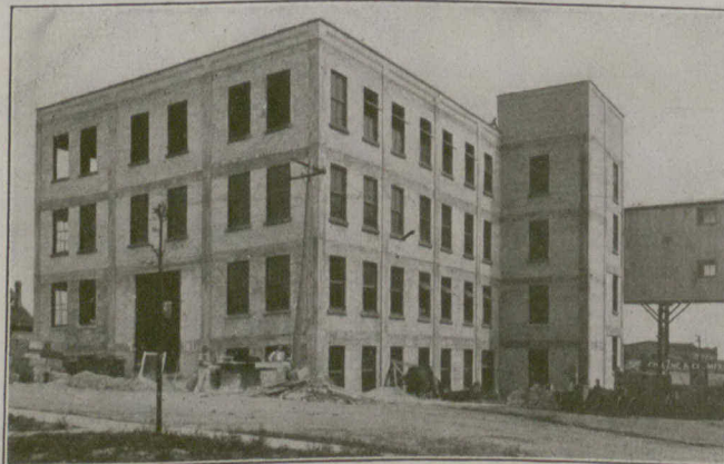
The Merchants Rubber Co. Building, Berlin, Ont., The Provincial Construction Co., Limited, Contractors.