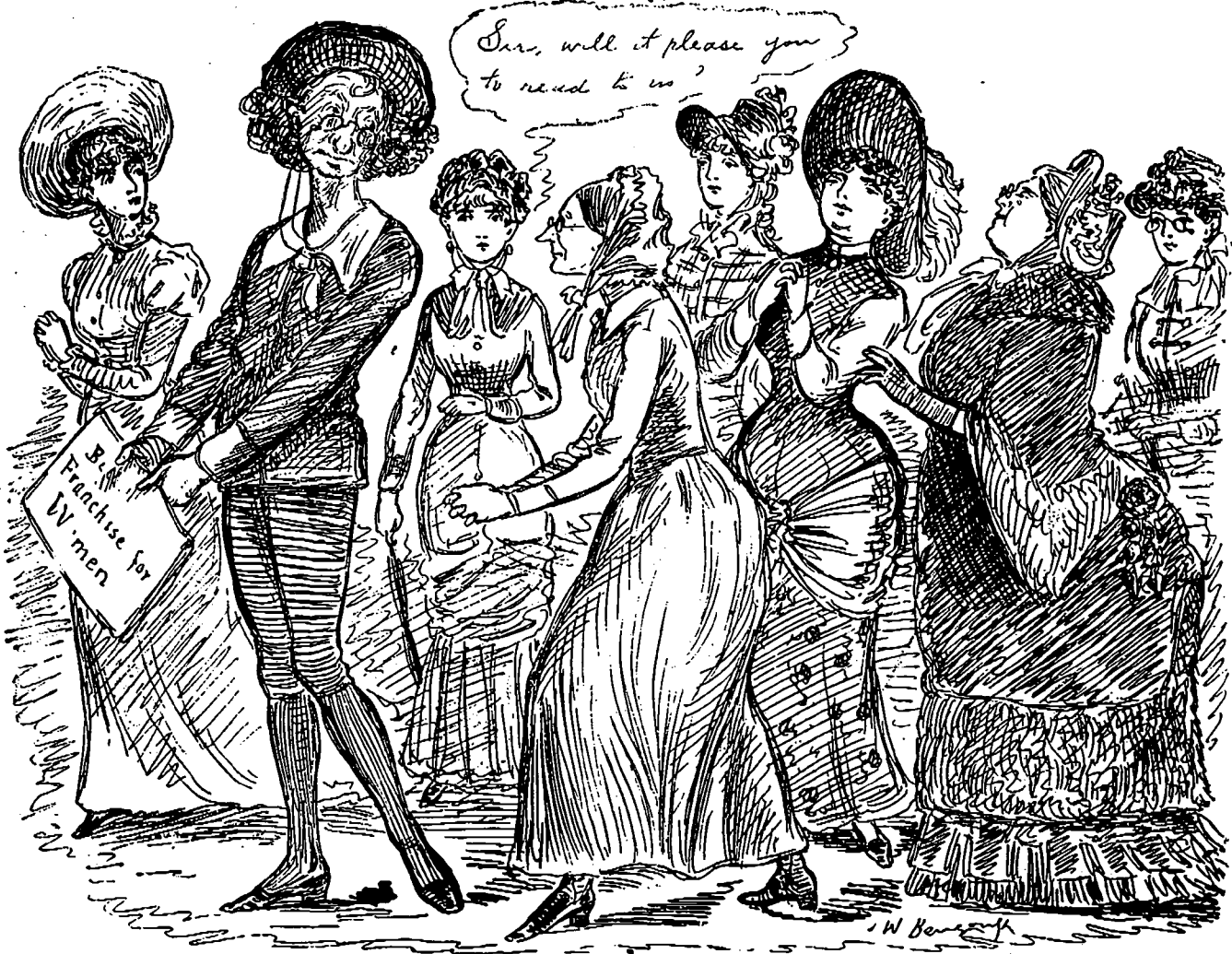
THE PARLIAMENTARY GROSVENOR CAPTURES THE RAPTUROUS MAIDENS!