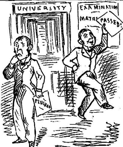
PLUCK VS. LOOK.