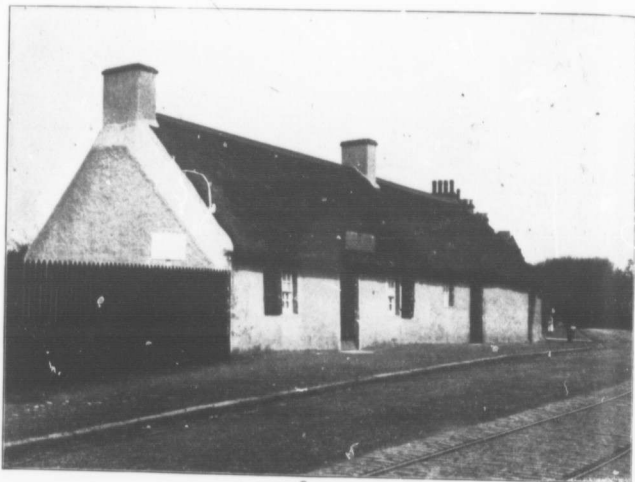
BIRTH PLACE OF ROBERT BURNS, ALLOWAY. "The Auld Clay Biggin" built by the Poet's Father.