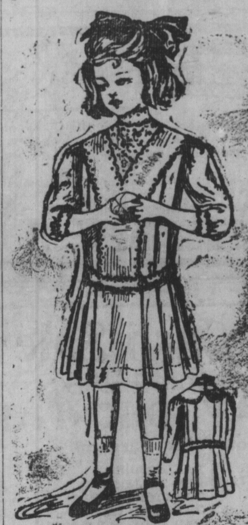
DRESS FOR LITTLE GIRL.

The outline of the wattleau plait grows almost a familiar sight. It is