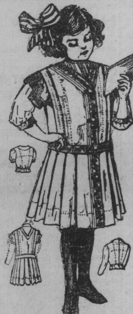
GIRL'S DRESS OF CASHMERE.

While the princess tunic will not be abandoned for a long time to come, it will form a compromise with the new.