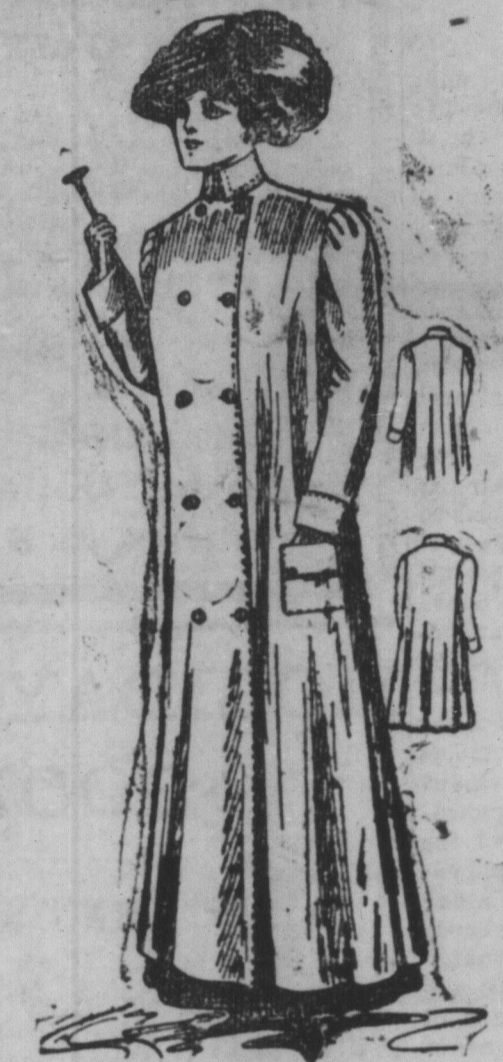
COAT FOR TRAVELERS.

The loose fitting long coat fills a great many needs, for it can be worn for traveling, for motoring and for