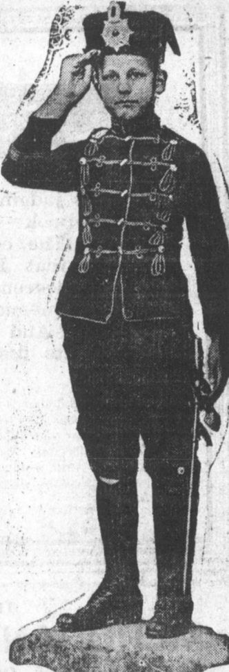
BOY SALUTING THE KAISER.

In Germany, as in most European nations, militarism is very much more in evidence than in our own land of the free. In all the cities there are constantly to be seen soldiers in the uniforms of their respective arms of the service. Parades are a matter of