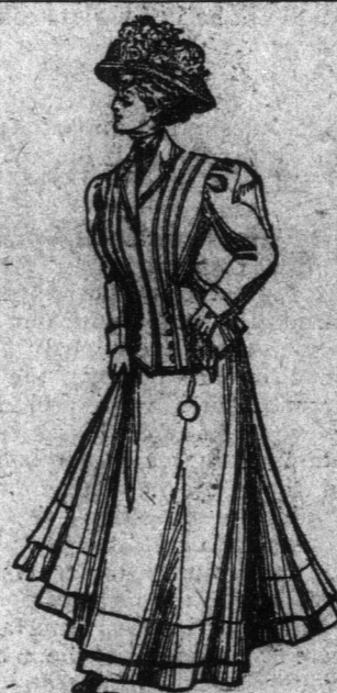
$25.00 Suit Monday... $13.75

This offering of Suits contains some of the most desirable styles that we have shown this season. There is the exceedingly popular "Merry Widow," which probably is the leading style in popular favor. Then again there is the appropriately named "Prince Charming," a very jaunty, fetching style that is pressing the "Merry Widow" for the honor of being most worn. These Suits are from one of the best women's tailors that we do business with, and are beautifully made and perfect fitting; and certainly as smart as any Costumes we have yet shown.