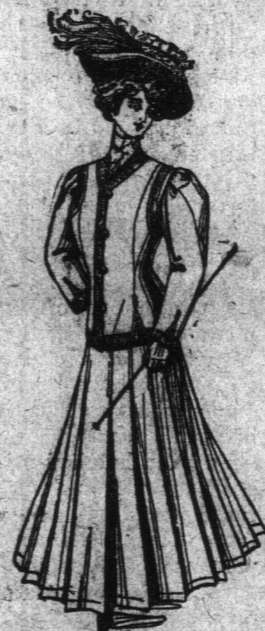
$27.50 Suit Monday... $13.75