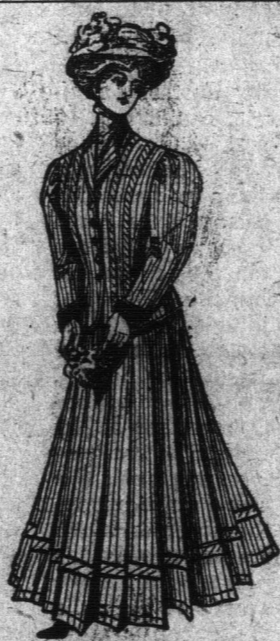
$30.00 Suit Monday... $13.75