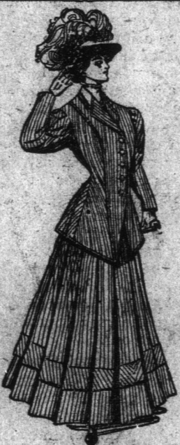
$35.00 Suit Monday... $13.75

No Suit Worth Less than $25. Any Suit in the Lot will sell on Monday for $13.75