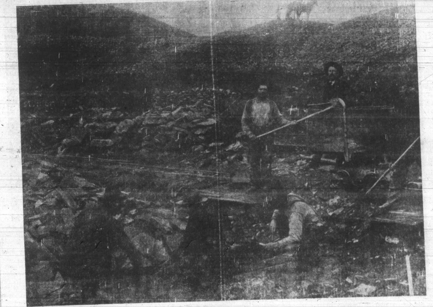
No. 2 ABOVE ON BONANZA