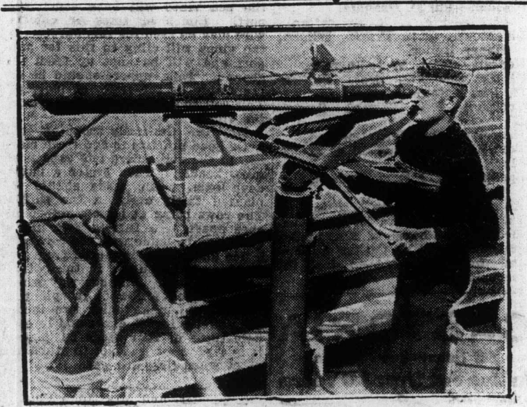
SIGHTING THROUGH 40 POWER TELESCOPE ON U. S. S.

systems that may be included in the new scheme. Actual construction on this scheme will be deferred until after the war, to avoid any immediate