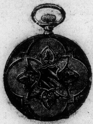
On Exhibition at BULLER BROS. and NEW- MAN AND SONS' Jewelry Stores.