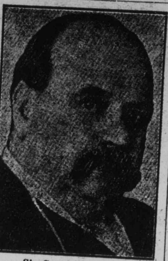
Sir George H. Reid.

Sir George Reid, High Commissioner for Australia, is well known for his geniality, his bulk and his ready tongue. Talking to him not long since, a correspondent asked him had he ever found himself at a loss for a back-answer. "Well," one day at a political meeting "down-under." It was near the close of my last campaign, and I remarked that I thought of retiring from politics, as I felt I was fast nearing that bourne from which no traveller returns. Upon which a voice at the back of the