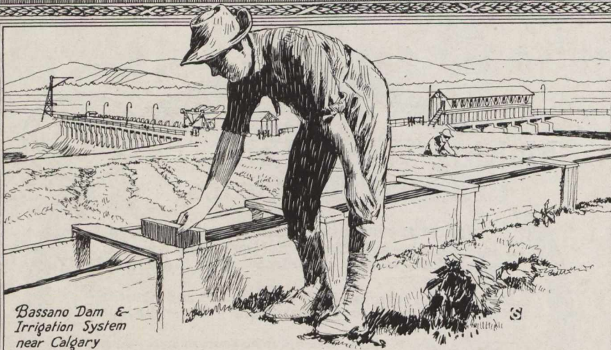
Bassano Dam & Irrigation System near Calgary