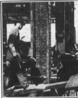
RIVETTERS ON THE JOB.

A guarantee is worth while having. Show how it is used to-day in buying and