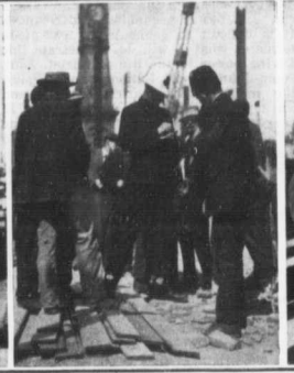
"O, YOU FOREIGNERS!"