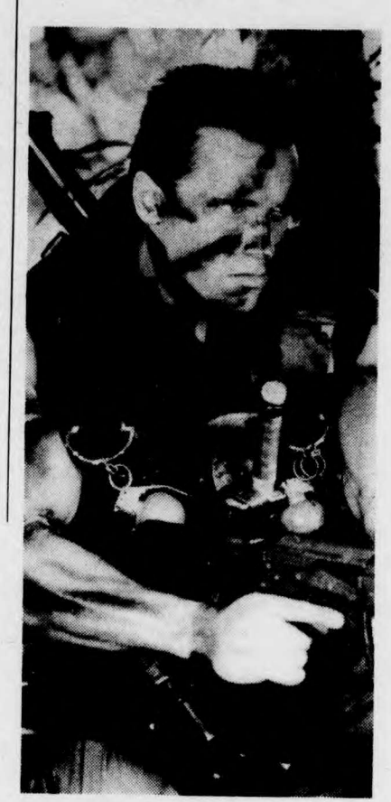
WHAT'S IN A PICTURE? Filler, folks. Rugged Arnold clutches his . . . umm-source of power.

turn Schwarzenegger, is one of the exhilirating aspects of Commando.