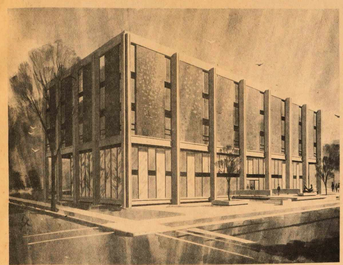
New Law Building