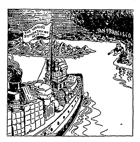
THROUGH THE GOLDEN GATE. -Webster in the Chicago Inter-Ocean.

the voice of faith is heard re-echoing the