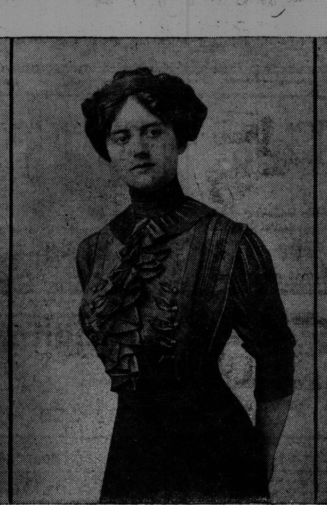
A DARK BLOUSE TO MATCH THE FALL STREET SUIT The blouse en suite is now an established which matches the dark green of the cloth of the feminine wardrobe and suit. Straps of green satin, with covered buttons to match, form an effective contrast with the green of the blouse. The blouse pictured is of gray chiffon, and the skirt is of green and blue, with an adjustable stock of the tones, the general effect being green, same material.