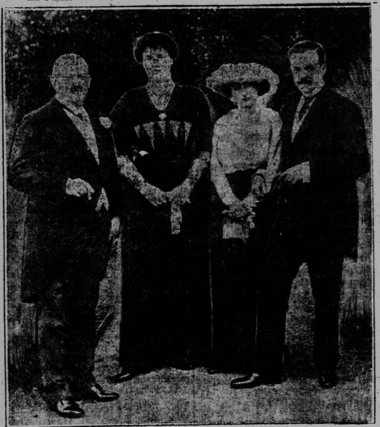
On the right are ex-King Manuel of Portugal and his fiancée, Princess Victoria Augustina of Hohenzollern. Next to the princess is Queen Amelia, mother of the king, and on the left Prince William of Hohenzollern, father of the princess.