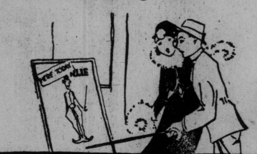
Age 20—Happy on Fifty Dollars a month.

How Fifty Dollars a Month looks to the Average Man