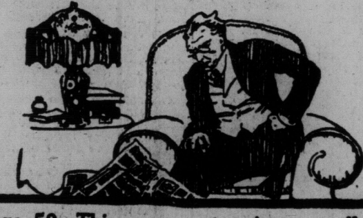
Age 50—Things are not going as well as they were.