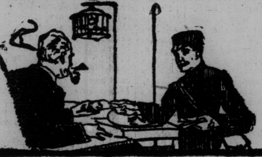
Age 60—He finds Fifty Dollars a month pension, added to what income is left, brings happiness.

You know of men well up in years who are still "drudging along". They cannot stop if they would, but must go on to the end of their days working for a living. You can avoid that.