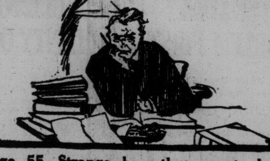
Age 55—Strange how these assets have depreciated! Fifty Dollars a month is good interest on $10,000, and not to be despised.