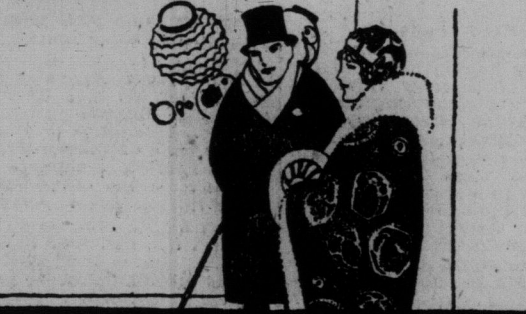
Age 35—Thinks he can easily afford to "spend" Fifty Dollars a month.