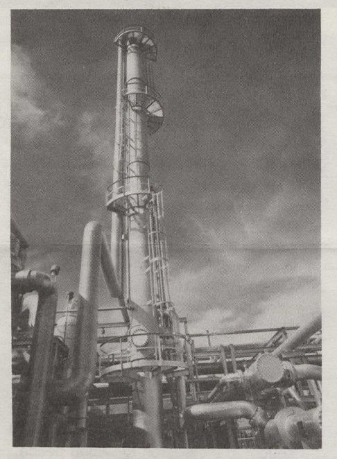
Maloney Steel Ltd. of Calgary, Alberta offers a complete range of engineering, design and fabrication services for the manufacture of oil and gas production equipment used in the offshore drilling operations.

The Canadian exhibit was one of the highlights at the Offshore Northern Seas '84 Conference and Exhibition in Stavanger, Norway last August.