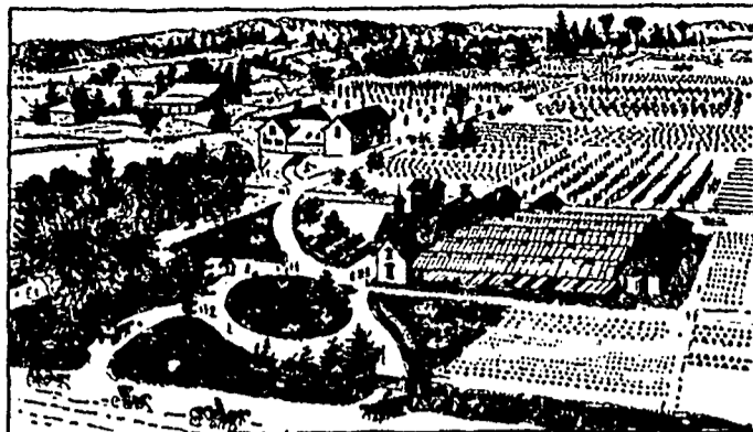
A Portion of the Fonthill Nurseries.