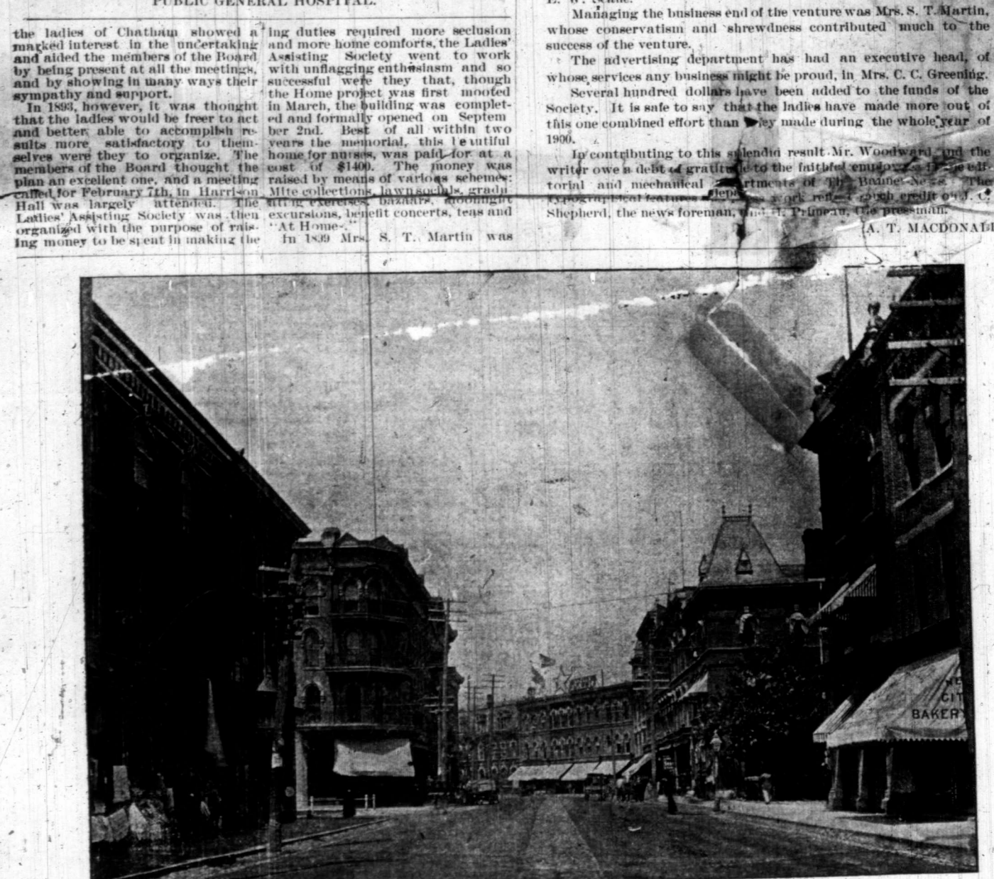
A VIEW OF KING STREET, LOOKING WEST FROM THE BIG CLOCK.