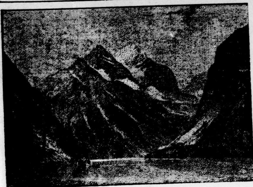
Mount Helena, Canadian Rockies.