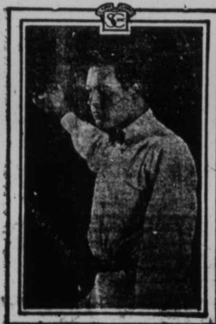
HAROLD LOCKWOOD in 'THE GREAT ROMANCE'

The camps situated as they are, on Little River Lake are ideally and artistically erected and it would be difficult to surpass them for comfort any where in Canada.