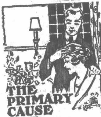
THE PRIMARY CAUSE