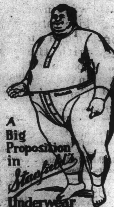
A Big Proposition in Stanfield's Underwear