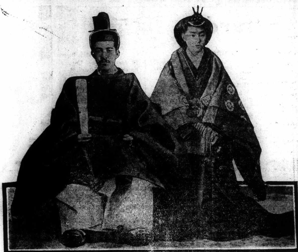
THE EMPEROR AND EMPRESS OF JAPAN

The Emperor of Japan, whose illness eclipsed the agitation of the California Land Law bill, was a sufferer from childhood with lung trouble. When young he was put under the treatment of an eminent German physician who although not robust he was spared the almost continuous sufferings of his household. He improved the condition of his youthful and younger members.