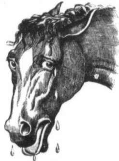
"My Boss has the other fellers"