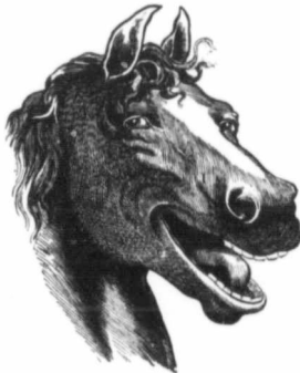
My Boss has the SUCCESS Spreader"

Frame Made Entirely of Hard Wood — Not Pine