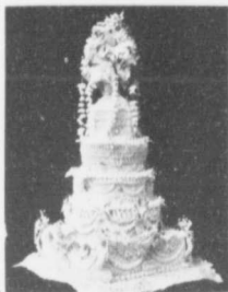
Weight of the Original Cake 129 lbs.