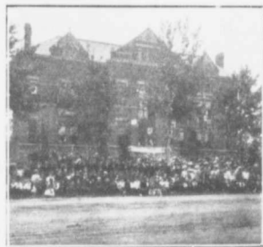
Simcoe Street School.