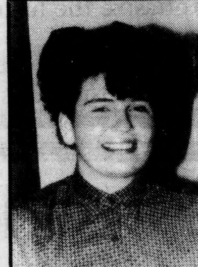
See? Jane Won

As for the unclaimed positions, it will go before council as to whether to have a byelection in the near future or in the fall. The unclaimed posi-Forestry representatives.