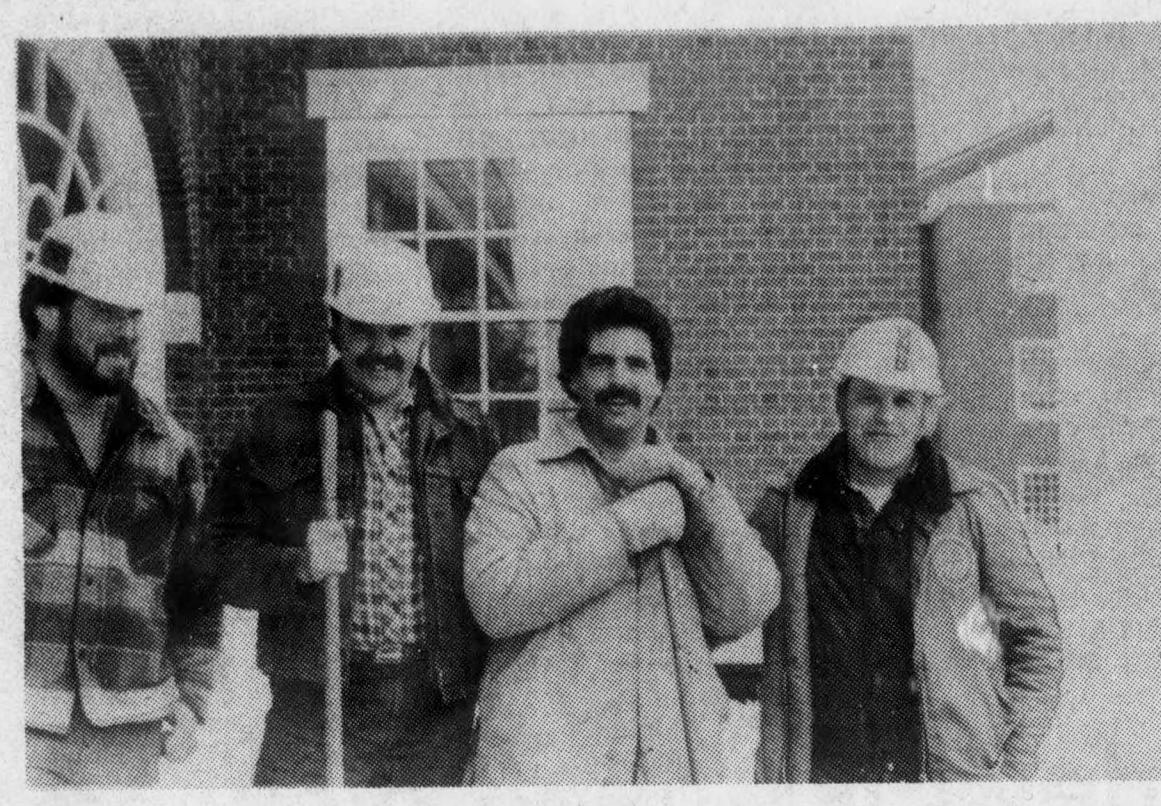
The Physical Plant Boys Maintenance I We can't answer cause we'd be bunching up.