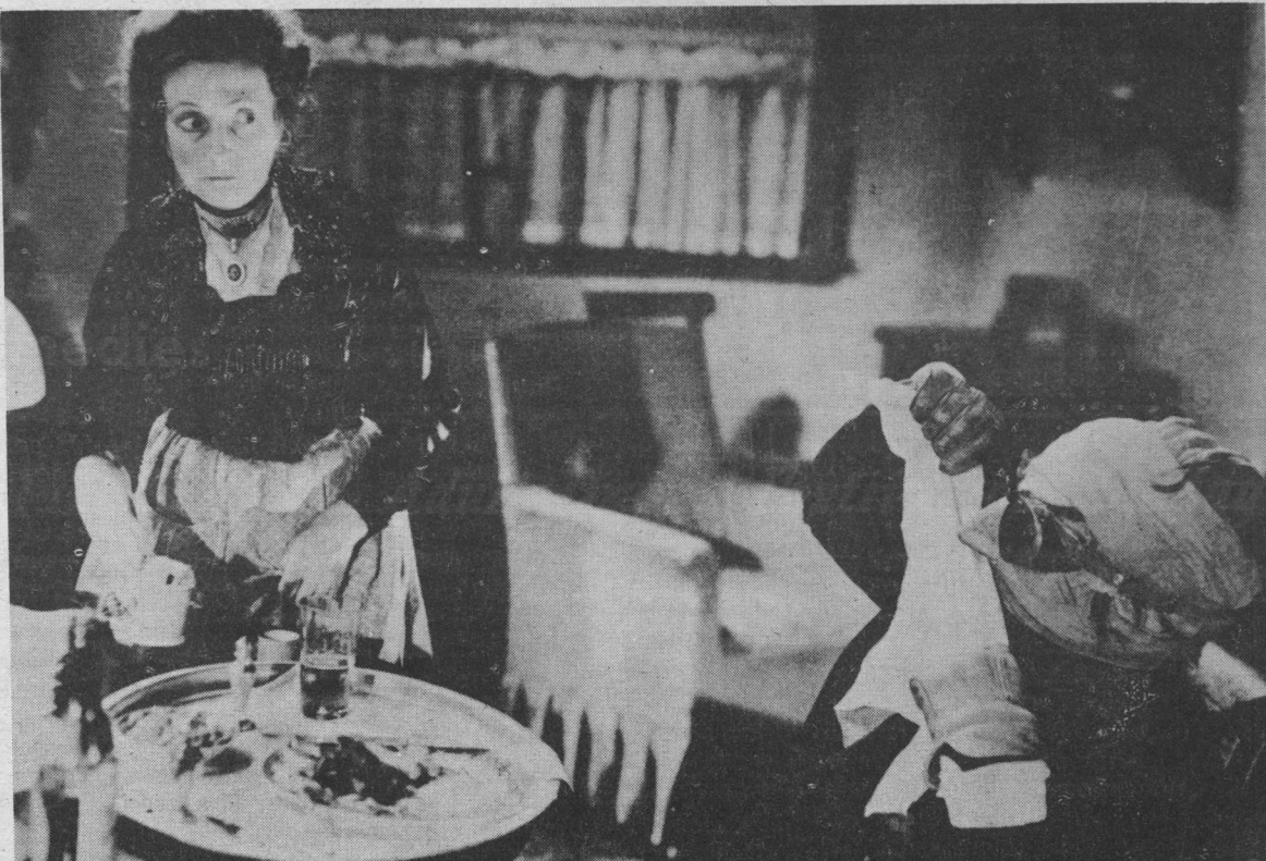
Servant Una O'Connor startles the well-wrapped Claude Rains in The Invisible Man , a feature in Edmonton Film Society's Science-fiction series at Tory Lecture Theatre. The tongue-in-cheek fantasy shows up on Feb. 19. Season tickets available at the door.

The fee for the course is $5.00. Pre-registration will take place at the Capilano Branch Library on Thursday, February 20th, between 6:30 p.m. and 7:30 p.m.