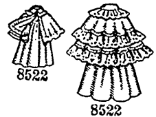
8522 Little Girls' Coat, with Hipple Cape, and a Straight Skirt (Gathered to a Yoke): 7 sizes. Ages, 1 1/2 to 6 years. Any size, 10d. or 20 cents.