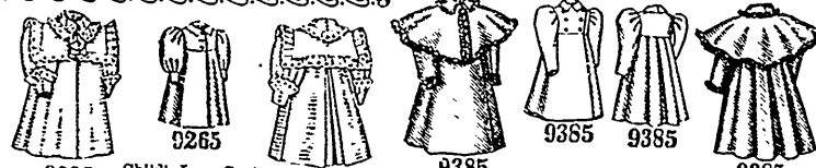
9265 Child's Long Coat, having its Skirt Gored at the Side Seams: 6 sizes. Ages, 1 to 6 years. Any size, 10d. or 20 cents.