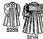
9288 Child's Long Coat: 7 sizes. Ages, 1 1/2 to 6 years. Any size, 10d. or 20 cents.