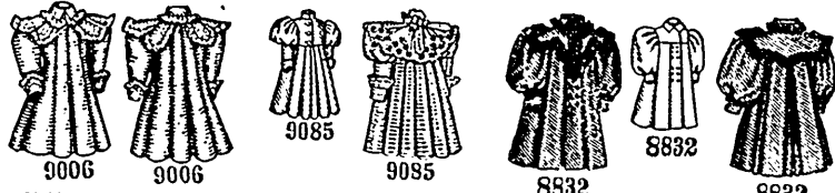
9006 Child's Long Coat: 4 sizes. Ages, 2 to 8 years. Any size, 10d. or 20 cents.