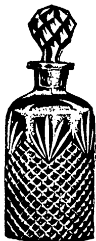
No. 282-2 OZ.