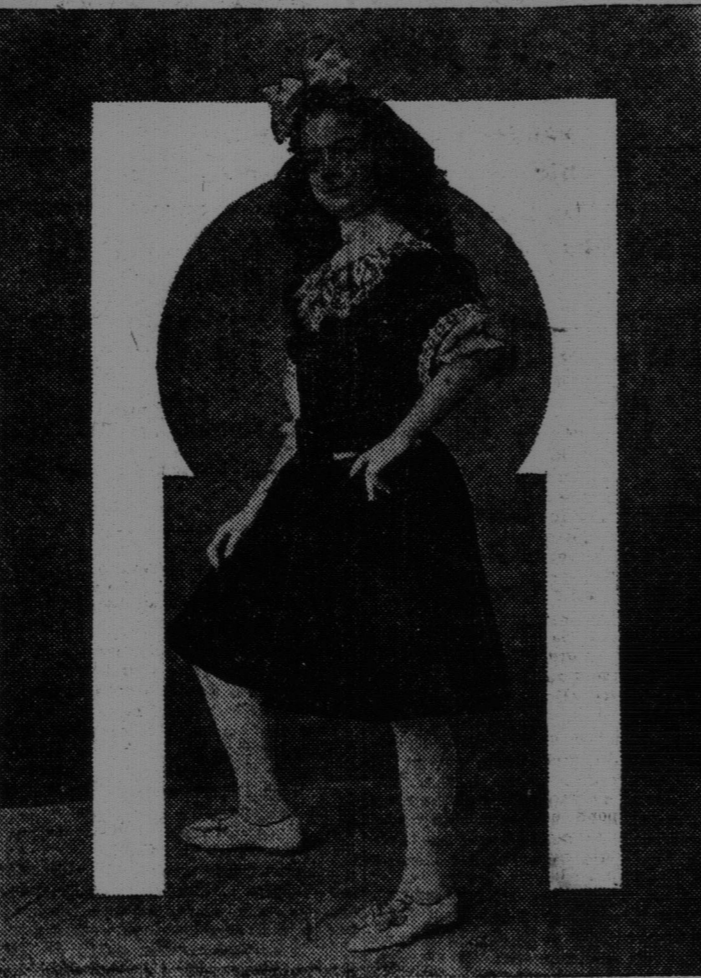
CHILD'S DRESS OF BLUE VELVET

Velvet will again be much used this season for more dressy costumes, and some how or other, the dignified, regal fabric is particularly becoming to children's fair skin and delicate coloring.