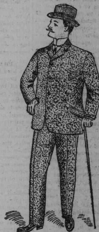
Men's 1904 Spring Suits.

Come and See. Prices From $2 up. Maybe there is no thought of your buying yet—time enough for that towards Easter perhaps, but just come and look and compare—you will not be pestered to purchase.