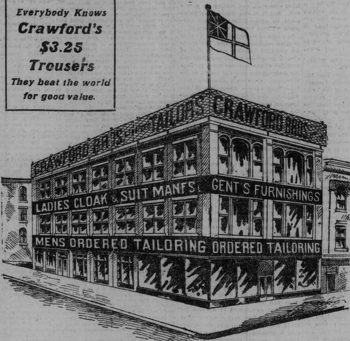
Cor. Yonge and Shuter Streets.

Exhibition of Man-Tailored Ready-to-Wear Spring Millinery.