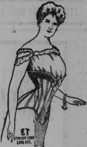
Wear "E.T." Corsets

We have secured a full line of these best of all! Straight Front Corsets. We can recommend them because they are full of exquisite lines of grace—they give military style and graceful dip effect sought for by smart women, and they combine the perfection of workmanship and material with the beautiful symmetry of the best Parisian models.