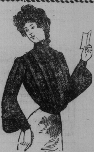
1904 Spring Blouses.

All Styles, Special Prices, $1.00 and $1.50.