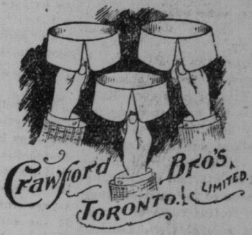
Smart Men's Fixings.

CRAVATS —direct from the cradle of fashion. New flowing ends and English Ascots, regular 75c line.